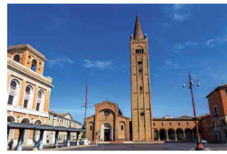
Basilica di San Mercuriale

the 20th century Palazzo delle Poste, an example of architecture of the "Ventennio" (1920-1930), also seen in significant traces in the buildings of Viale della Libertà and Piazzale della Vittoria, near the train station