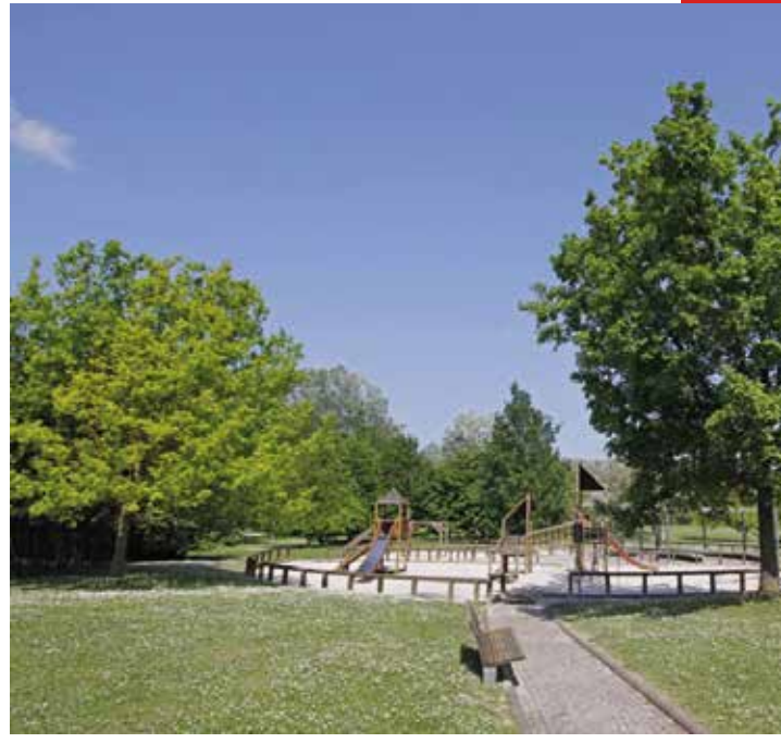
Parco Urbano Franco Agosto

Just a short distance from Piazza Saffi main square, it is worth spending some hours at "Franco Agosto" City Park, a unique green area in Italy - in part due to its position in the urban fabric next to the old city walls - for its botanical variety and for its size. The park covers a large surface, bordered by the Montone River and the green area belonging to the City Hospital (Pierantoni). It is perfectly equipped for any requirement: restaurants, bars, children's play areas, sporting facilities, refreshment spots, entertainment and leisure opportunities round out the offerings of the park.